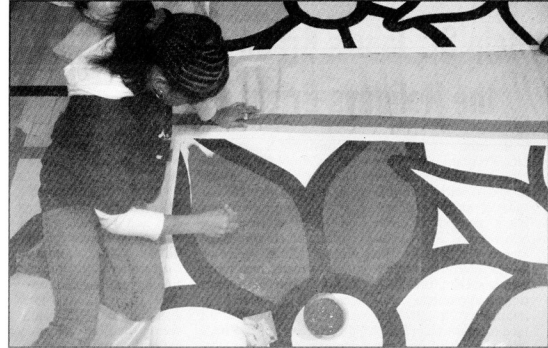
A student helps paint a floral panel, which will grace a yellow icon when the Big Apple's first metered cab celebrates its 100th anniversary next year.